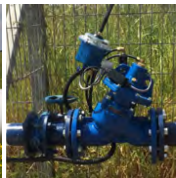
FLOW & PRESSURE CONTROL