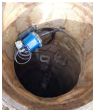
SEWAGE PIT LEVEL MONITORING